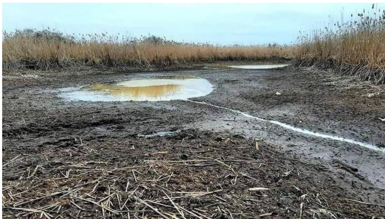
Figure 4 – Shallowed part of a typical floodplain below the lower Dnieper section (February 2023) [8]