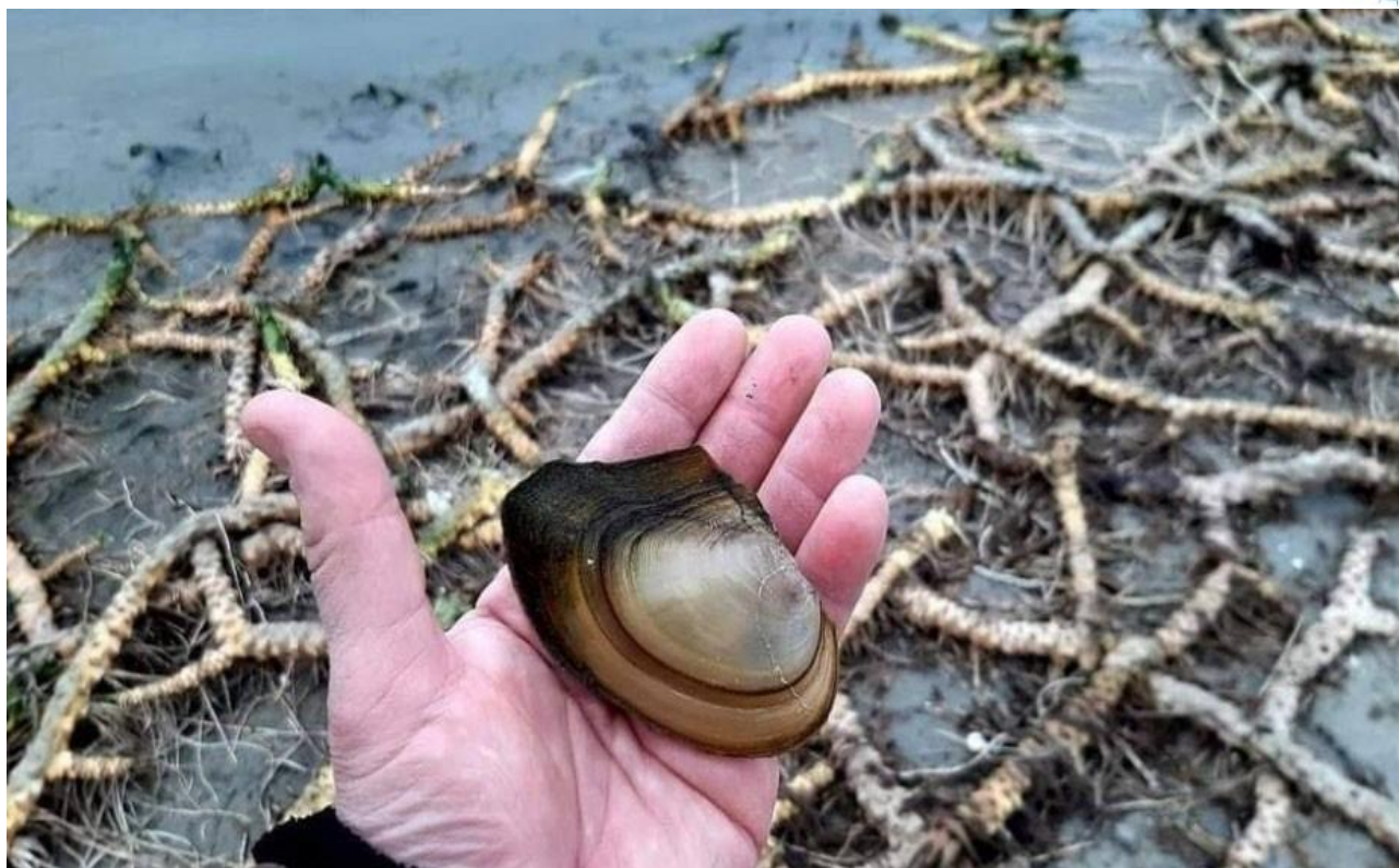
Figure 5 – Dead mollusk Sphaerium sp. and roots of aquatic plants Nuphar lutea on the bare coast of one of the typical reservoirs of the lower Dnieper section (February 2023) [8]

According to the results of our observations, low levels of water in the water system below the lower Dnieper section remained for almost the entire last decade of January 2023. Then the lack of water in the water system was compensated by the inflow of salty (sea) water from the Dnieper-Buh estuary. At the beginning of February, the water level rose again to average values, but not due to the restoration of the inflow of fresh water from the Kakhovka Reservoir, but due to the inflow of sea water from the coastal areas of the Black Sea.