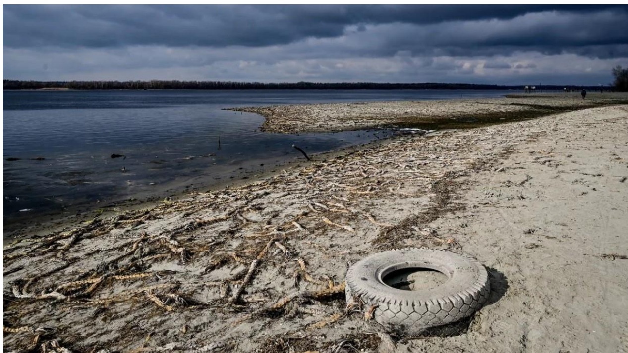
Figure 3 – A fragment of the exposed coastline of the Kakhovka Reservoir with garbage and remains of aquatic plants [18]

Thus, in the Kakhovka Reservoir in January-February, the water level was lower than the seasonal long-term values by 2.2-2.8 m, in the lower Dnieper section the water level was lower than the normal values by 1.6-1.8 m. As a result of this in the reservoir, significant areas of silty soils accumulated here since the 1950 year were exposed (Fig. 3), floodplains and watercourses below the Dnieper were almost completely dewatered (Fig. 4, 5).