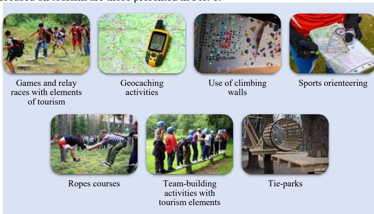
Puc. 1. Kind forms of physical education focused on tourism

Under current educational conditions, it is possible to actively involve students in tourism-related activities and significantly enhance their level of physical activity through the implementation of innovative pedagogical technologies. Such technologies are widely applied in international educational practice and are gradually being introduced into the Ukrainian educational system. The results of our study show that the most effective forms of physical education focused on tourism are those presented in Pic. 1.